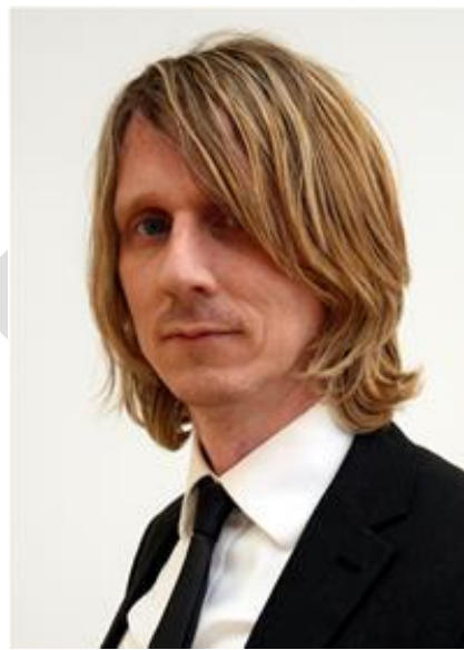
Portfolio Holder for Climate Change

This plan will be refreshed every 3 years and reviewed annually.